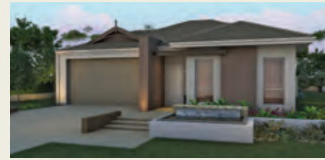
Switch eight 100e2