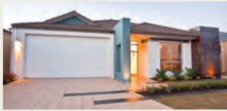
Switch eight 100

Change the outside look of your Switch eight 100 by switching the elevation.