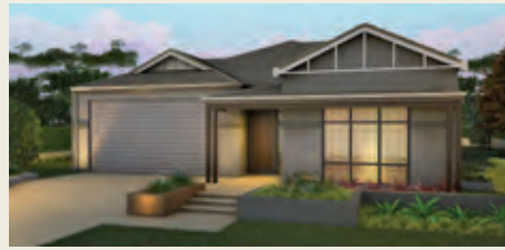
Switch eight 100e1