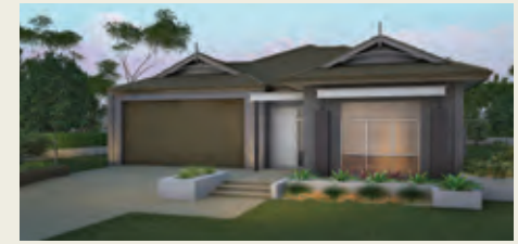
Switch eight 100e3