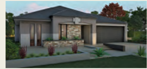
Switch eight 90e3