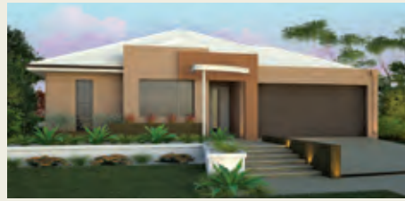
Switch eight 90e1