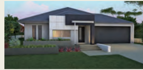
Switch eight 90e2