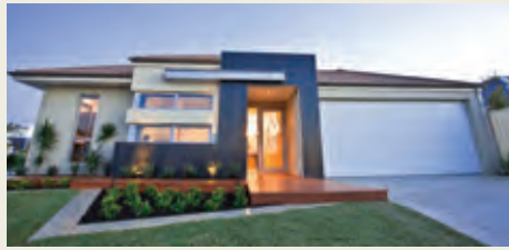
Switch eight 90

Change the outside look of your Switch eight 90 by switching the elevation.