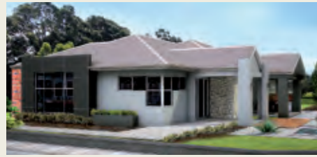
Switch eight 10e1