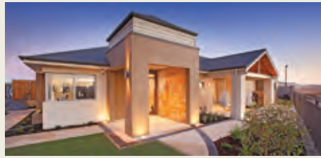
Switch eight 10

Change the outside look of your Switch eight 10 by switching the elevation.