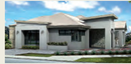
Switch eight 10e2