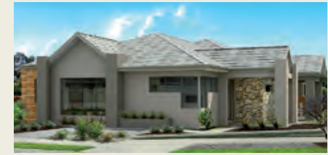
Switch eight 10e3