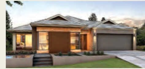
Switch eight 60e3