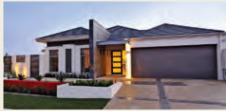
Switch eight 60

Change the outside look of your Switch eight 60 by switching the elevation.