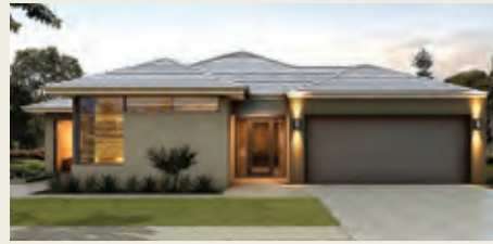
Switch eight 60e1