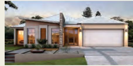
Switch eight 60e2