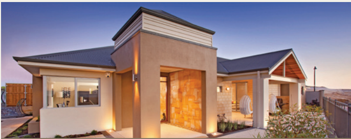
Switch eight 10