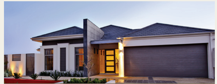
Switch eight 60