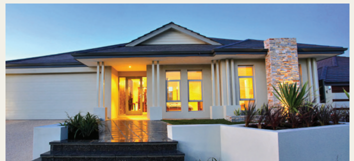
Switch eight 70