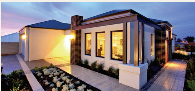
Switch eight 30